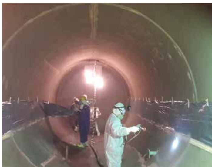
Belzona 1391S spray-applied

For more information, please contact your local Belzona representative: